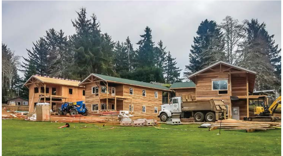
At the B'Nai B'Rith Children's Camp in Lincoln City, Oregon, JHC built three new cabins totaling nearly 7,000 square feet. These new bunkhouses replaced four older, smaller cabins. When kids arrive in June, they will enjoy the much-needed additional sleeping capacities complete with new restrooms.

April 26th marks the company's 38th birthday! Any way you say that, fast, slow, clear or mumbled, it sounds like a long time! A big "thank you" to everyone who has contributed to our success over the years...er decades!