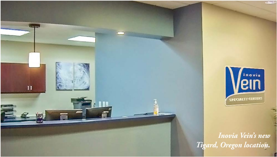
Inovia Vein's new Tigard, Oregon location.